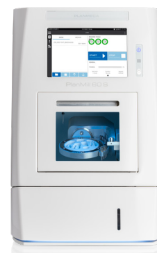
PlanMill® 60 S