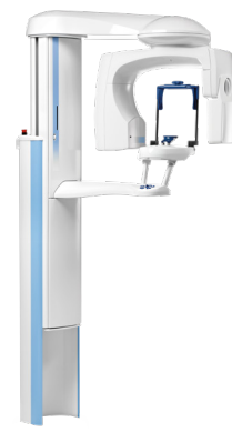
Planmeca ProMax® 3D Classic and LEC