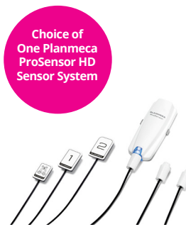
Planmeca ProSensor® HD Sensor System