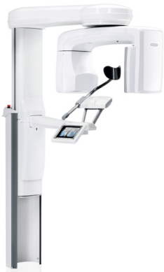
Planmeca Viso® G7 and G5