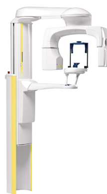
Planmeca ProMax® 3D Plus and LEP