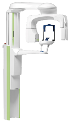
Planmeca ProMax® 3D Mid and LEM