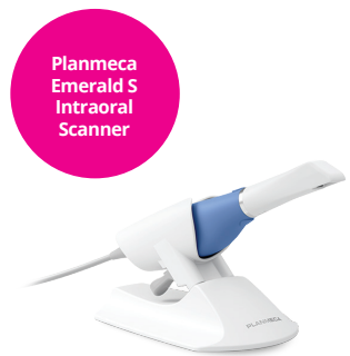
Planmeca Emerald® S Intraoral Scanner